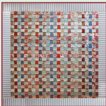
“Woven as One” Pick yours up today!